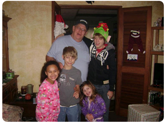
New Photo 1