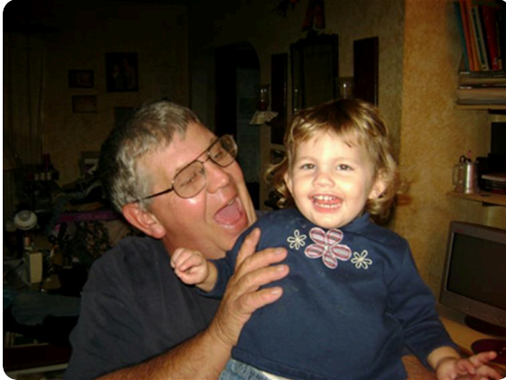
New Photo 1