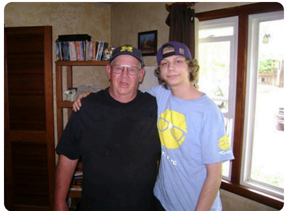
New Photo 1