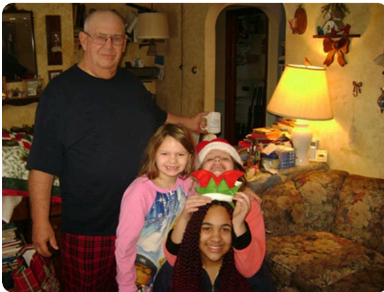
New Photo 1