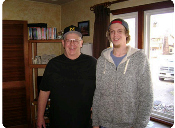
New Photo 1