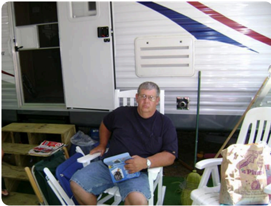
New Photo 1